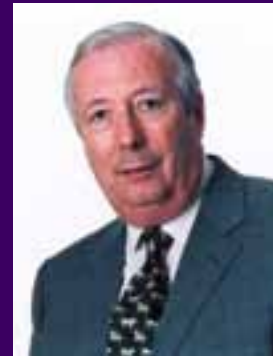
Lord Harris of Peckham Sponsor of the Harris Academy Falconwood

“As an employer and a father, I strongly believe that a good education is the best start that you can give a child. Harris Academy Falconwood promotes love of learning, willingness to work hard, curiosity, self confidence and a real desire to do well in life. In addition, as an 11–18 Academy our Sixth Form offers an outstanding range of courses so your child will not have to move schools for Sixth Form. I look forward to welcoming you to Harris Academy Falconwood and to the Harris Federation of South London Schools.”